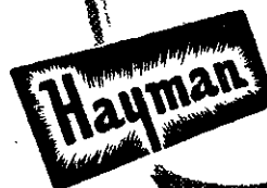
Table type ..... £6/10/3 Floor type ..... £13/5/9 All prices include packing and freight to nearest port

FULLY GUARANTEED Made by L. T. Hayman Ltd., Auckland