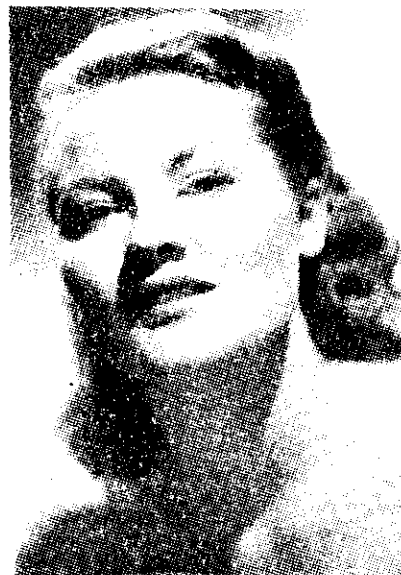
PATTI PAGE, who will be heard from 3ZB at 6.30 this evening