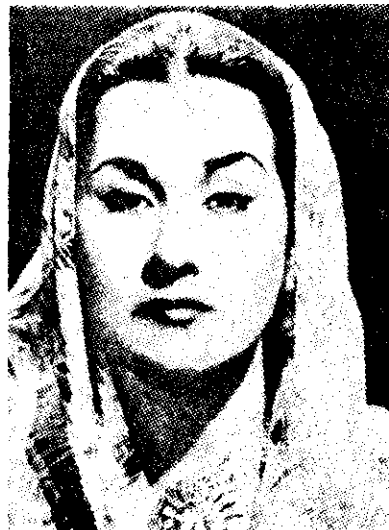
YMA SUMAC, who will be heard from 1ZB at 7.30 this evening