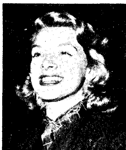
ROSEMARY CLOONEY, one of the stars to be heard from 3ZB in the programme beginning at 9.30 this evening