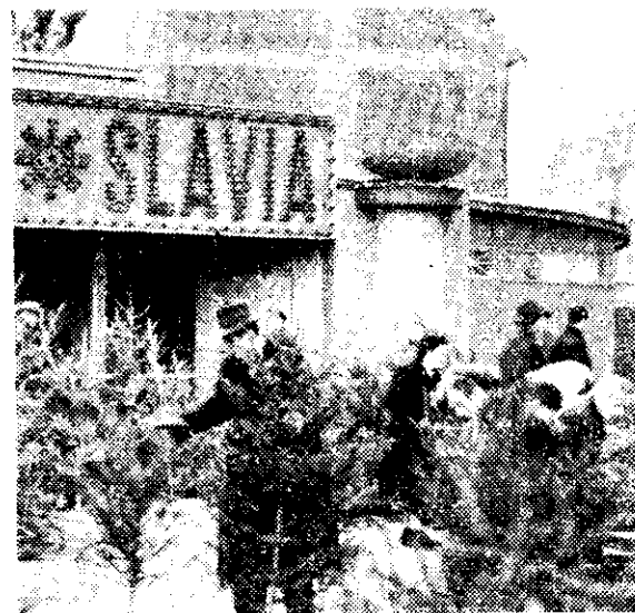
CHRISTMAS trees on sale outside the Circus Building in Prague and, at top of page on left, a panorama of Toledo, showing the Cathedral on the left and on the right the ruins of the Alcazar

erland, which he briefly mentioned in his second talk. He had known Austria before the last war, and he suggests that today it is for the modest traveller the most attractive country in Europe—for food, lodging, travel and almost anything you may want to buy it offers quite astonishing value, and "no Euro-