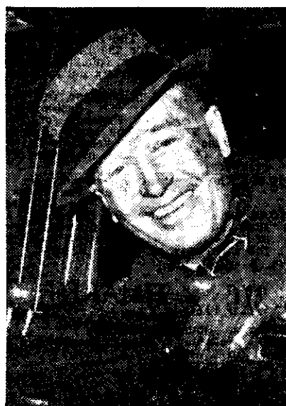
MAURICE CHEVALIER, who will be heard from 2ZB at 9.30 this evening. Our photograph shows him about to set off by car on one of his recent tours