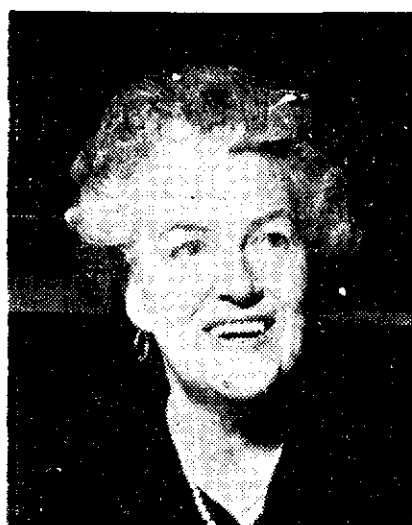
GRACIE FIELDS, the star to be heard from 2ZA at 9.45 this morning