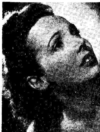
JESSIE MATTHEWS, who will be heard from 2ZA at 9.30 this morning in "Out of the Past"