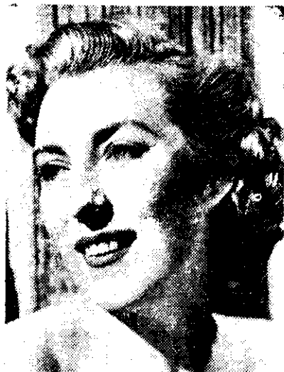
VERA LYNN, who will be heard from 3ZB at 6.15 this evening