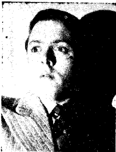
RICHARD ATTENBOROUGH Squandered talent