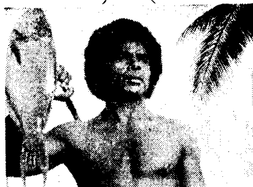
Whether it's fishing or bowls or any of the other popular sports, you'll find Fiji rich in facilities.

INFORMATION: For fares, general information and a free copy of TEAL's Guide to Fiji consult leading travel agents throughout New Zealand or TEAL Auckland, Wellington and Christchurch.