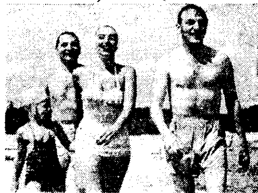
Fiji is a children's paradise, with sandy beaches, safe swimming, and opportunity to gather fascinating shells and other sea treasure, making it the ideal family holiday.