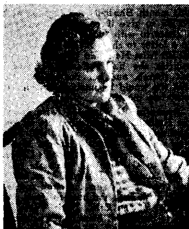
DAPHNE DU MAURIER