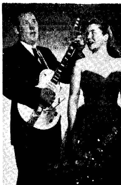
THE STARS to be heard from 1ZB at 9.30 this evening. Les Paul and Mary Ford