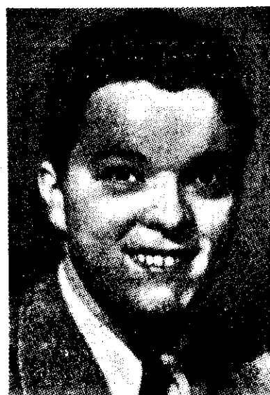
DICKIE VALENTINE, the star to be heard from 1ZB at 5 o'clock this afternoon