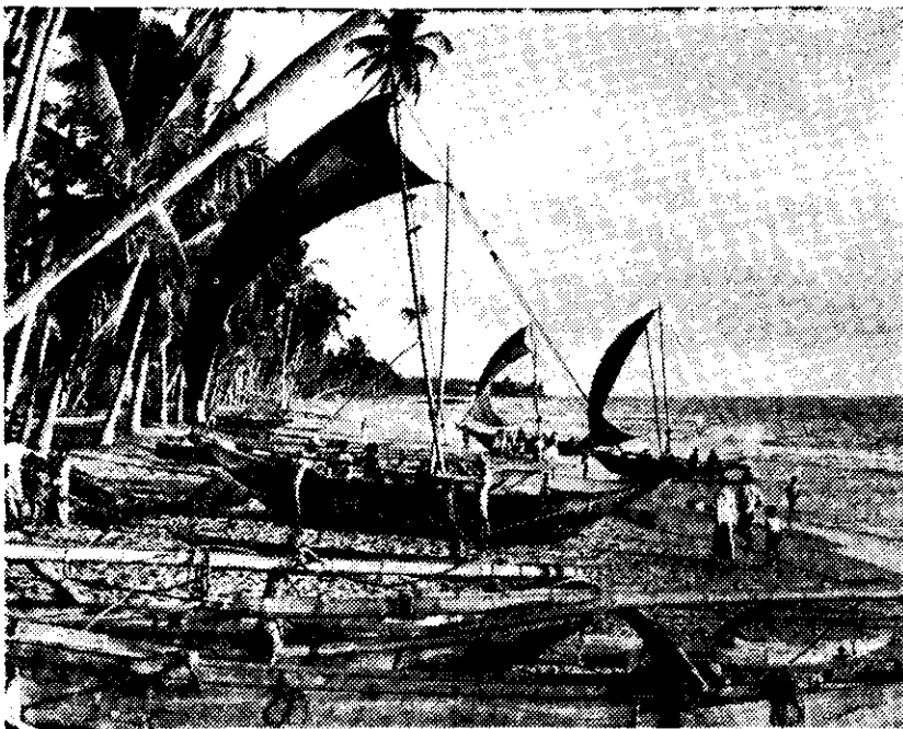
(ON the day, Saturday, April 10, the Queen and the Duke of Edinburgh reach Ceylon, 2YC will broadcast at 7.30 p.m. and 3YA at 9.30 p.m. a BBC programme "This is Ceylon," one of a series specially written to give a sound picture of places visited on the Royal Tour. This feature will be repeated from 3YC at 7.30 p.m. on Monday, April 12. The illustration shows outrigger craft on the beach near Colombo