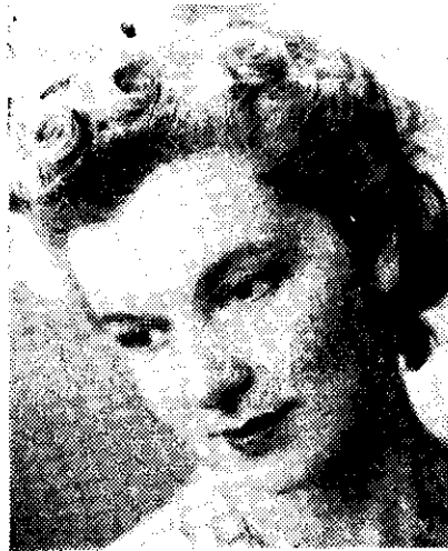
ROSAMOND LEHMANN, who will be heard from 4YA at 9.30 this morning speaking about "My First Novel"

6.45 Around the Wards: Hospital Requests 7.0 Dusty Labels 7.15 Sports Page 7.30 Crooning Along 7.45 On the Light Side 8.16 A Symphonic Portrait of Cole Porter 8.40 Gems from Opera 9.3 Light Music Concert 9.30 A Spot of Humour 10.0 Reflections 10.30 Close down