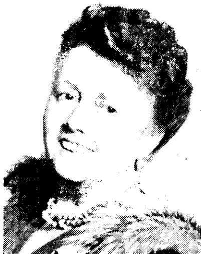
ELISABETH SCHUMANN, one of the soloists to be heard in the Bach Mass in B Minor from IYC at 8 o'clock this evening