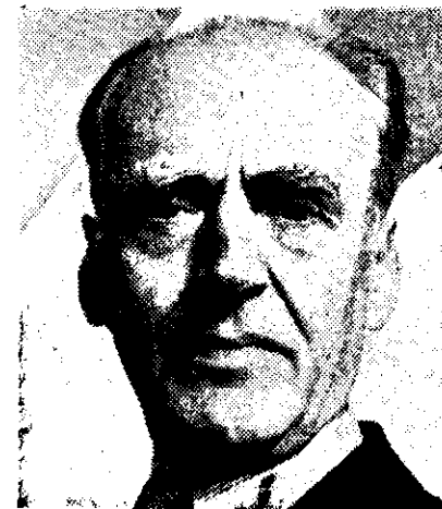
BASIL CAMERON, who conducts the BBC Concert Hall Orchestra in the programme to be heard from 2XN at 9.30 this evening