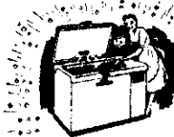
1st PRIZE "Frigidaire" Home Food Freezer £199.0.0