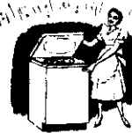
3rd PRIZE "Dishmaster" Automatic Electric Dishwasher £89.10.0