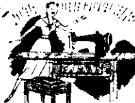
4th PRIZE Singer de luxe Electric Sewing Machine £75.5.6