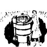
5th PRIZE "Beatty" Electric Washing Machine £58.0.0

6th, 7th, 8th: 3 Philco Radios Model 521 (£29.15.0 each). 9th, 10th, 11th: 3 Philco Radios Model 401 (£16.16.0 each). 12th, 13th, 14th: 3 Morphy-Richards Automatic Toasters (£6.19.6 each). 15th-24th: 10 Morphy-Richards Irons (£4.6.6 each). PLUS 24 Consolation Prizes of £1.