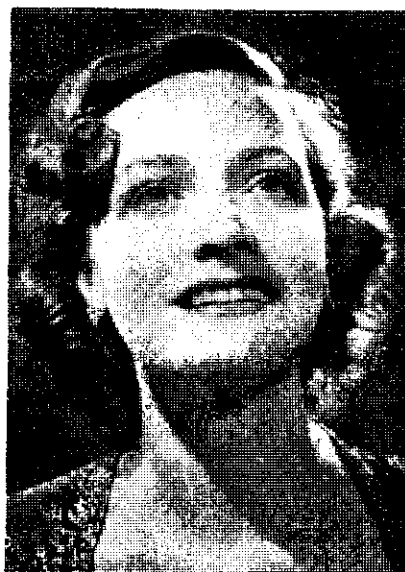
KATHLEEN FERRIER, who will be heard from 4YZ this evening at 8.28