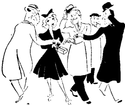
A method which might be classified as "appealing" or "flirtatious"