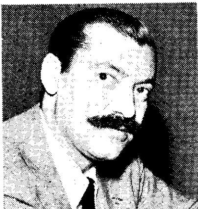
JERRY COLONNA, comedian in the Bob Hope Show heard recently from 4ZB and 2ZA