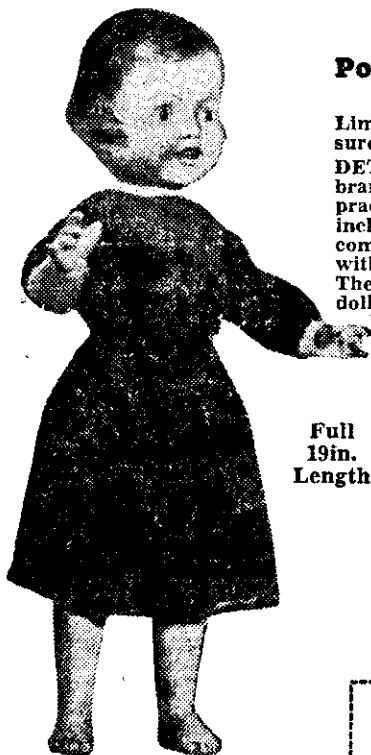
Actual photo of "KORKA" Doll