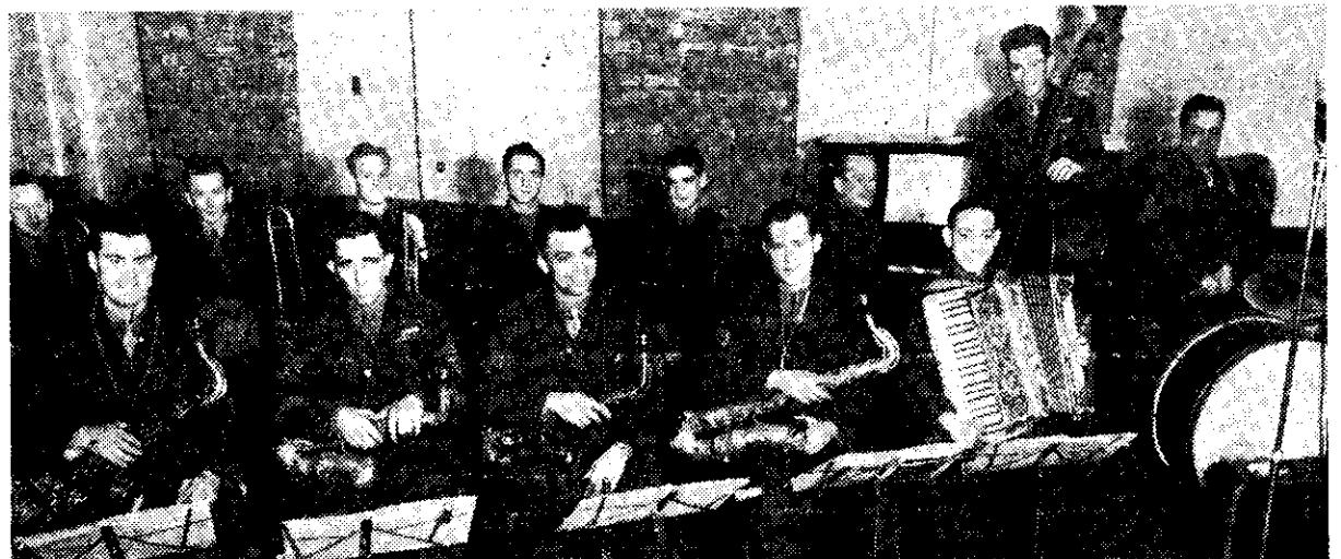
ONE OF THE U.S.M.C. DANCE BANDS, whose recordings (made in Wellington at 2ZB), will be heard from ZB stations