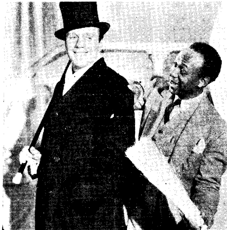
Below: JACK BENNY and "Rochester" in the Jack Benny Show, from 3ZB and 4ZB this Sunday, October 17