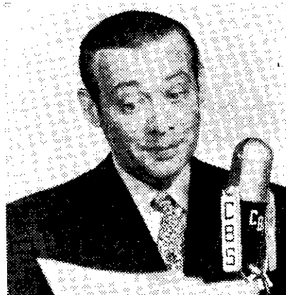
PHIL BAKER, who will be heard in the Jack Benny Show from 4ZB on Sunday, September 19