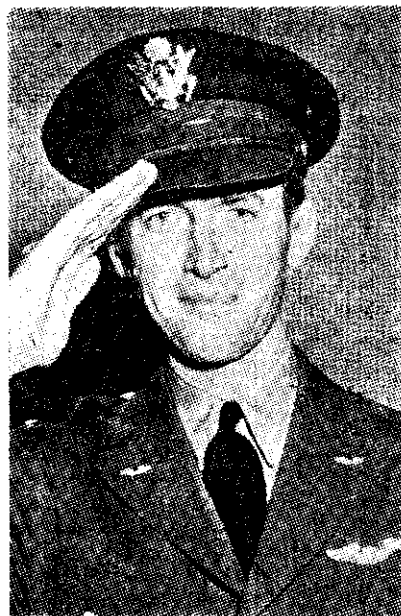
JAMES STEWART: what should be his job in the U.S. war effort?