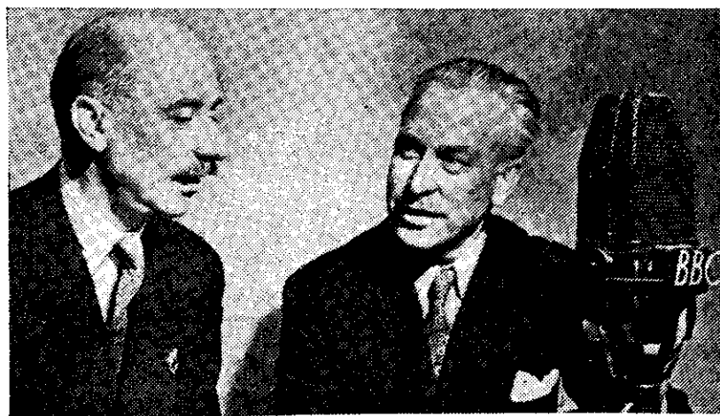
IN CONFERENCE: Sir Adrian Boult (left), who recently relinquished his post as the BBC's Director of Music, confers with his successor, Arthur Bliss