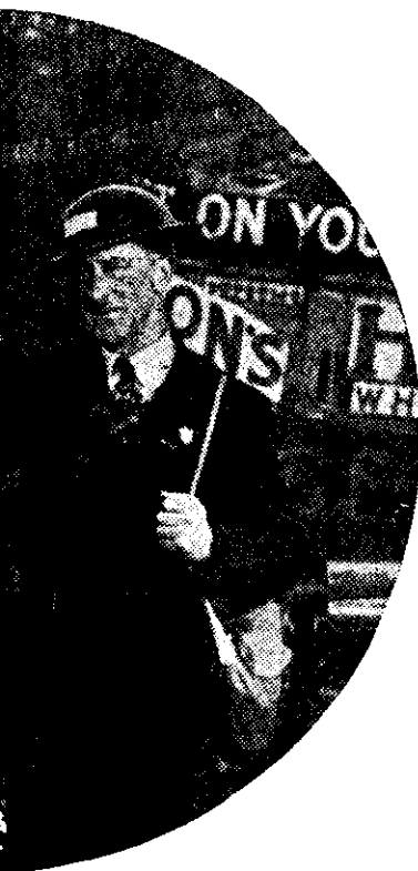
London, Cecil Madden, of the BBC, interviewer and broadcaster who is now a heard in the series "Something Going in Now"