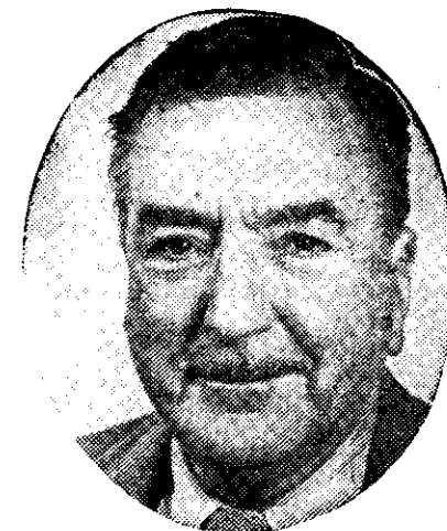
HAROLD MEADE is one of the players featured in the new ZB serial, "The Legion of Death."