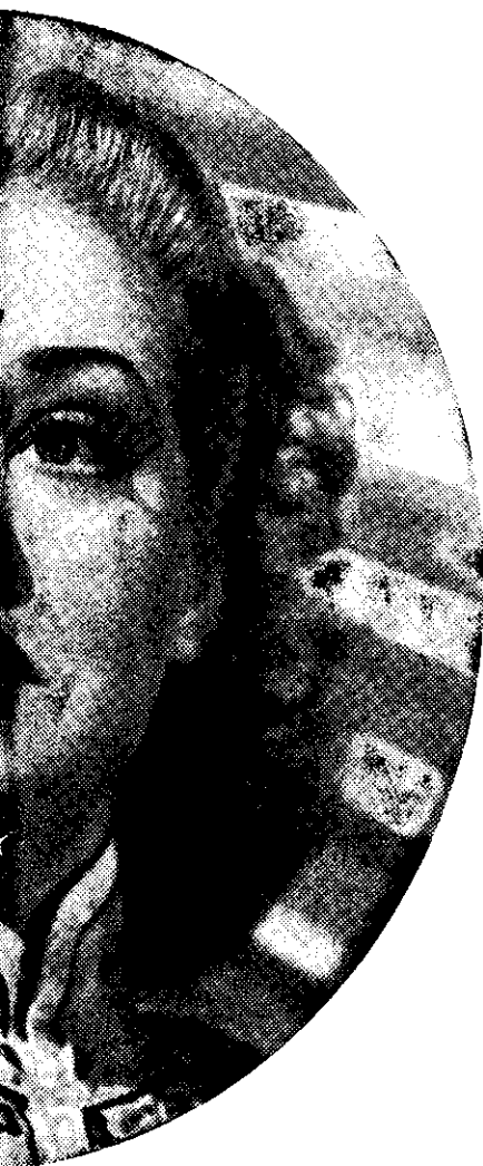
ing Star" at Station 22B on Sunday, May songs in her husky contralto