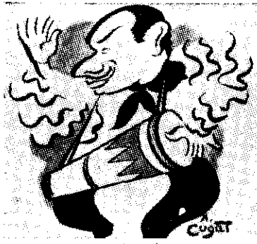
Right: Xavier Cugat is happy when he can pull out his drawing board and pencils. He has been a cartoonist for the Los Angeles "Times." Inset: A self-cartoon