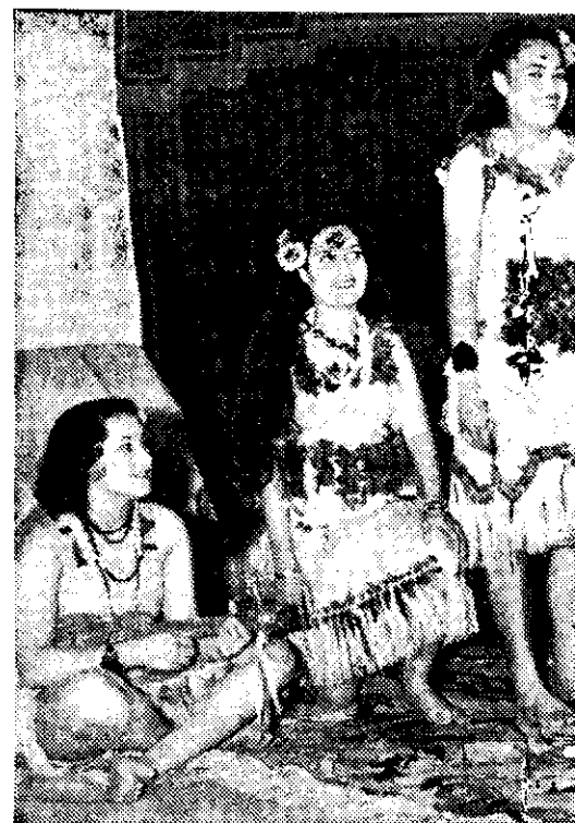
THIS GROUP OF SAMOANS gave a performance recently. They will broadcast again in 2YA