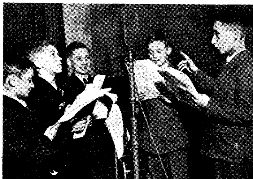
BBC photograph YOUNG LONDON EVACUEES were chosen by the BBC to play the parts of the boys who "asked for more" in a radio serial version of "Oliver Twist." The picture shows them rehearsing before a microphone