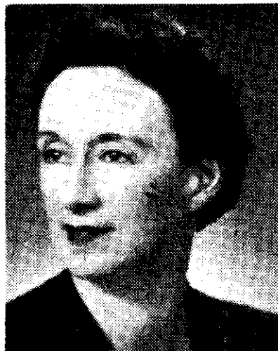
Alan Blakey photographs