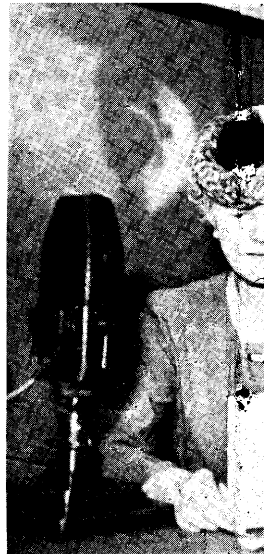
MRS. WINSTON CHURCHILL, wife of the Prime Minister, will be heard on the BBC's Empire Service on the 10th