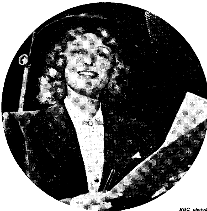
ANNA NEAGLE who has returned from America to make another film in England, at the "mike" in the BBC shortwave programme "Lights of London"