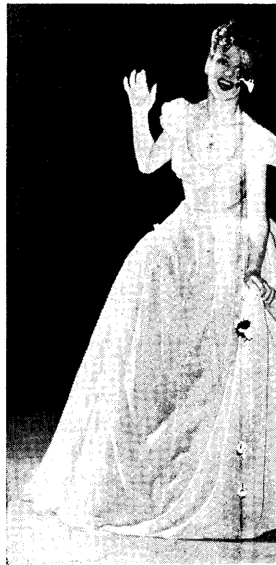
PATRICIA BURKE, singer of popular songs, brings a feature of the BBC's showwave