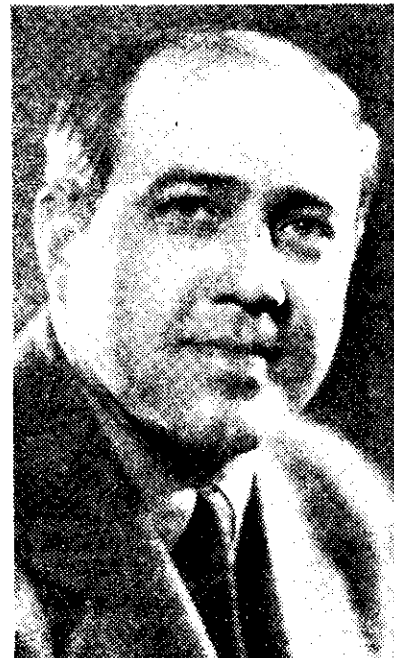
RICHARD CROOKS, the American tenor, who will be heard in a recorded recital from 2ZB on December 7, at 11.30 a.m.