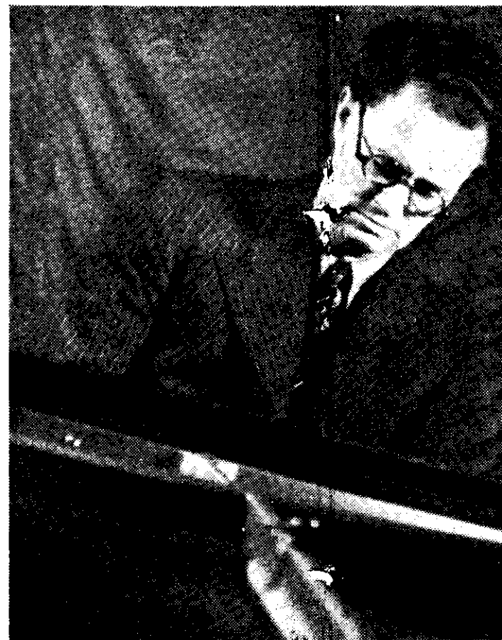
LEW JONES at the piano. A striking study of the well known composer who is doing special arrangements for Theo Walters's 12B note appears on this page