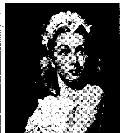
If IRINA BARONOVA, famous Russian Ballet Star, offered you a cigarette, it would be a DE RESZKE —of course

All programmes in this issue are copyright to The Listener, and may not be reprinted without permission.