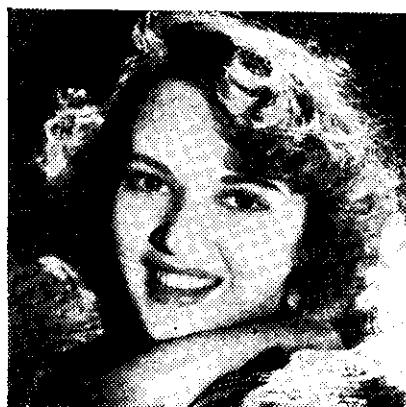
GALE PAGE, Hollywood film star, plays leads in two "Academy Award" dramas which will be heard from 2ZB on Tuesday, November 18, and Thursday, November 20, at 8.0 p.m.