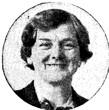
"GRAN," who conducts 1ZB's Home Service session at 2.30 p.m., Mondays to Fridays, inclusive