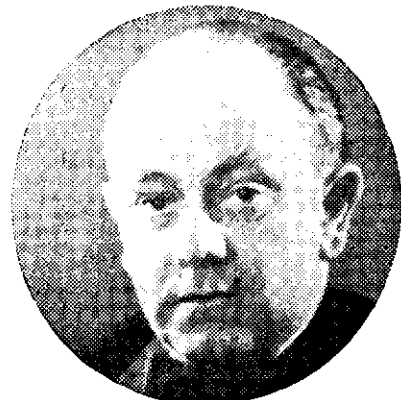
VERNON BARTLETT , British M.P. and famous newspaper correspondent, is frequently heard in the BBC feature, "Britain Speaks"