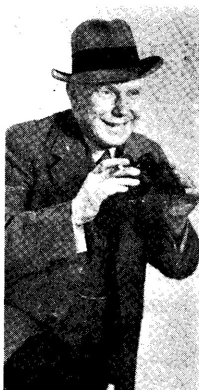
"THE TOPPER" is the name under which a well-known Dunedin racing authority conducts a session of turf news and hints from station 4ZB at 9.45 p.m. every Friday