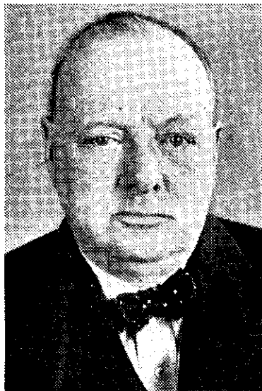
WINSTON CHURCHILL: 1ZB listeners should note that the final episode of the serial feature, "Imperial Leader," will be broadcast by 1ZB on September 13