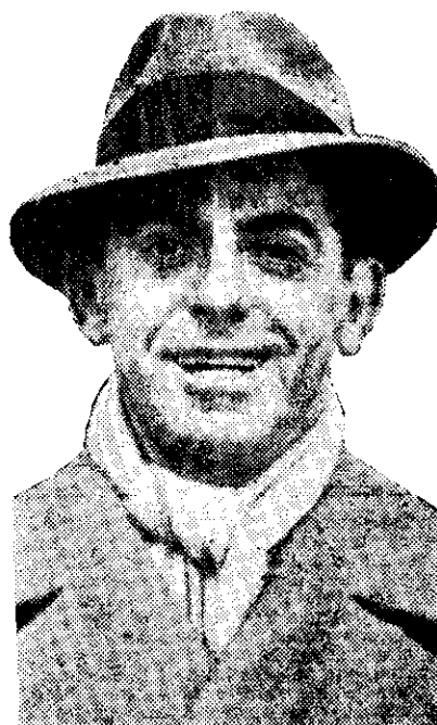
EDDIE CANTOR (above) is the entertainer featured in 2ZB's "Morning Star" session on September 7