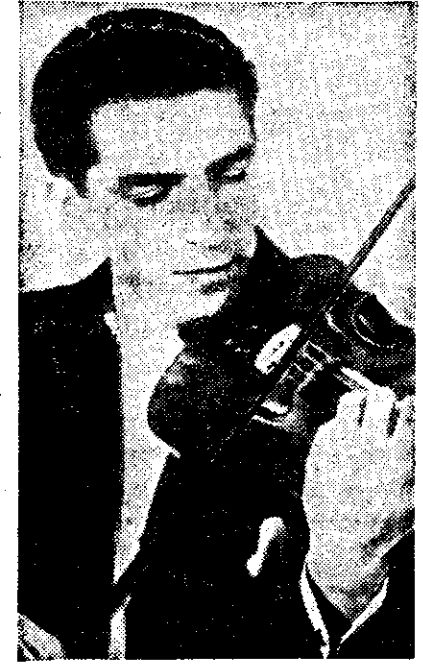
MANTOVANI, who is featured in the "Kings of Jazz" session from 1ZB on Monday next