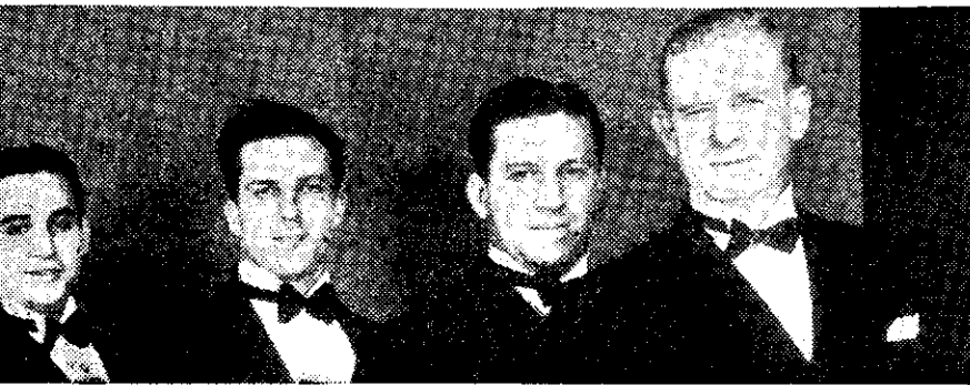
a combination frequently heard from the YA 2YC during the coming week