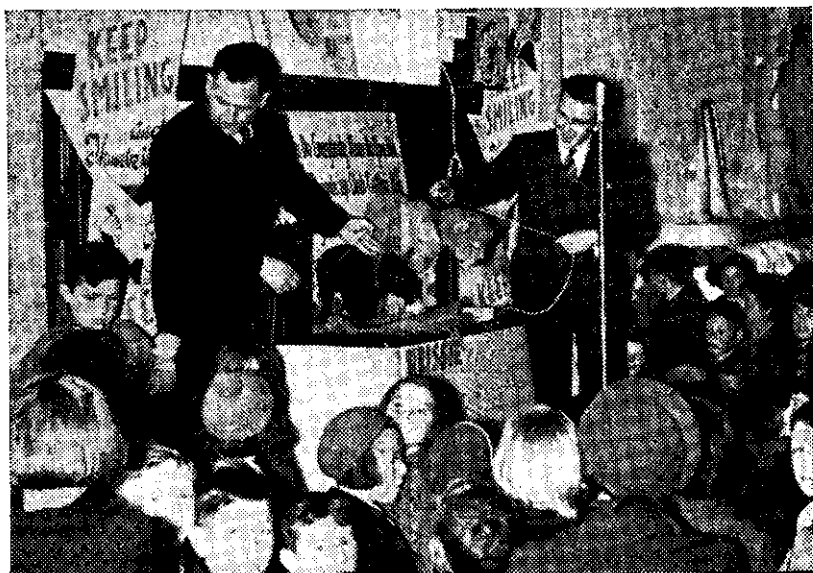
ONE SMALL PIG ("Claude") and one small lamb ("Chrissie") for sale: A busy scene at a recent children's party held by the Thumbs Up Club at Palmerston North

So many telephone calls followed that a further public appearance was arranged at a children's party at the Regent Theatre the following morning. Both Claude and Chrissie were auctioned for patriotic purposes.