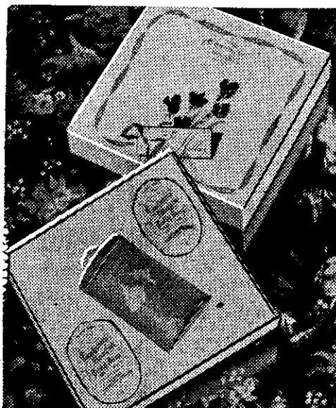
CASHMERE BOUQUET GIFT BOX. It contains Talc and two cakes of soap. 2/6.

Nothing is more charmingly appropriate than fragrant Cashmere Bouquet for Mother's Day. Buy your gift NOW from any chemist or store... and be certain of your Mother's pleasure on Sunday, 11th May.