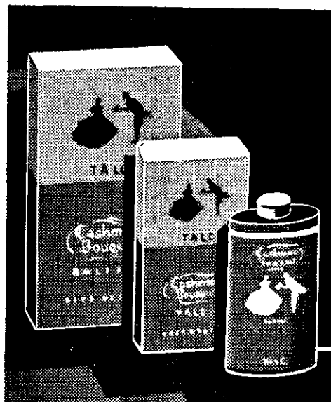
CASHMERE BOUQUET TALC. Three sizes. Cartons inscribed "Best Wishes". 10d., 1/8, 2/9.