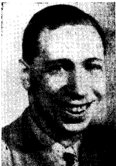
GEORGE FORMBY will entertain listeners to 2ZA during the breakfast session on May 1