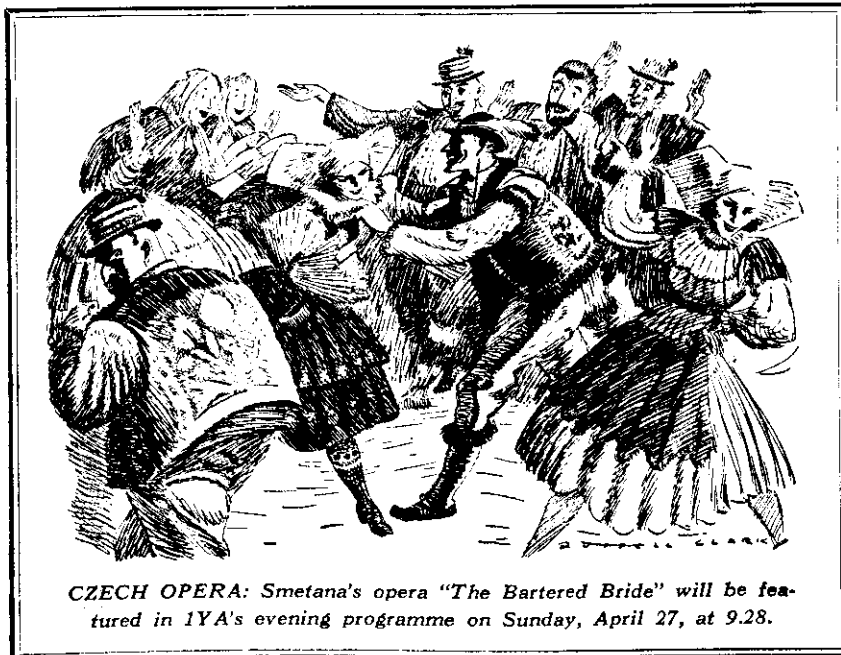
CZECH OPERA: Smetana's opera "The Bartered Bride" will be featured in 1YA's evening programme on Sunday, April 27, at 9.28.